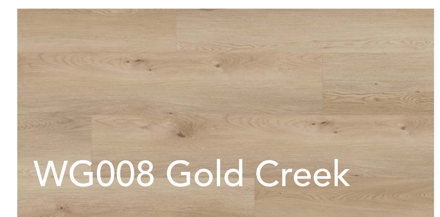
WG008 Gold Creek