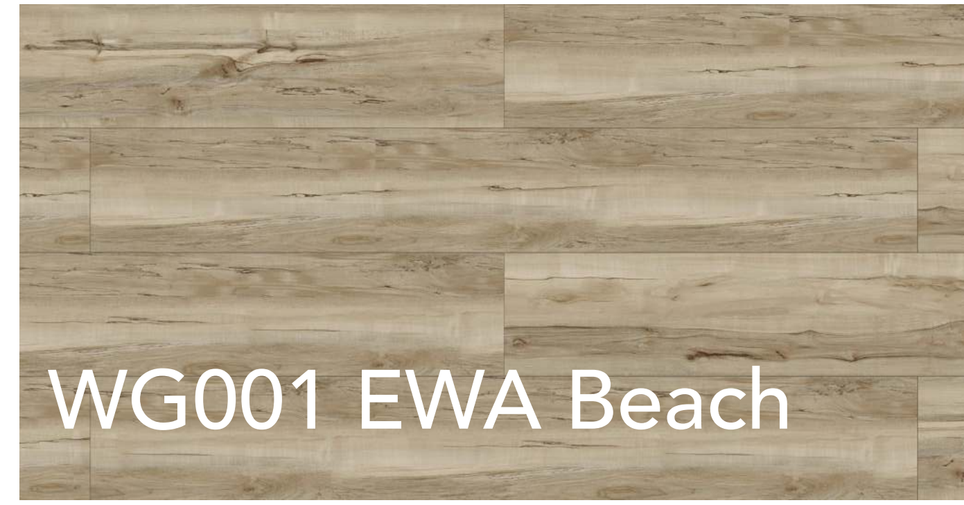
WG001 EWA Beach

Production designed to a sustainable environment. ZERO trees used.